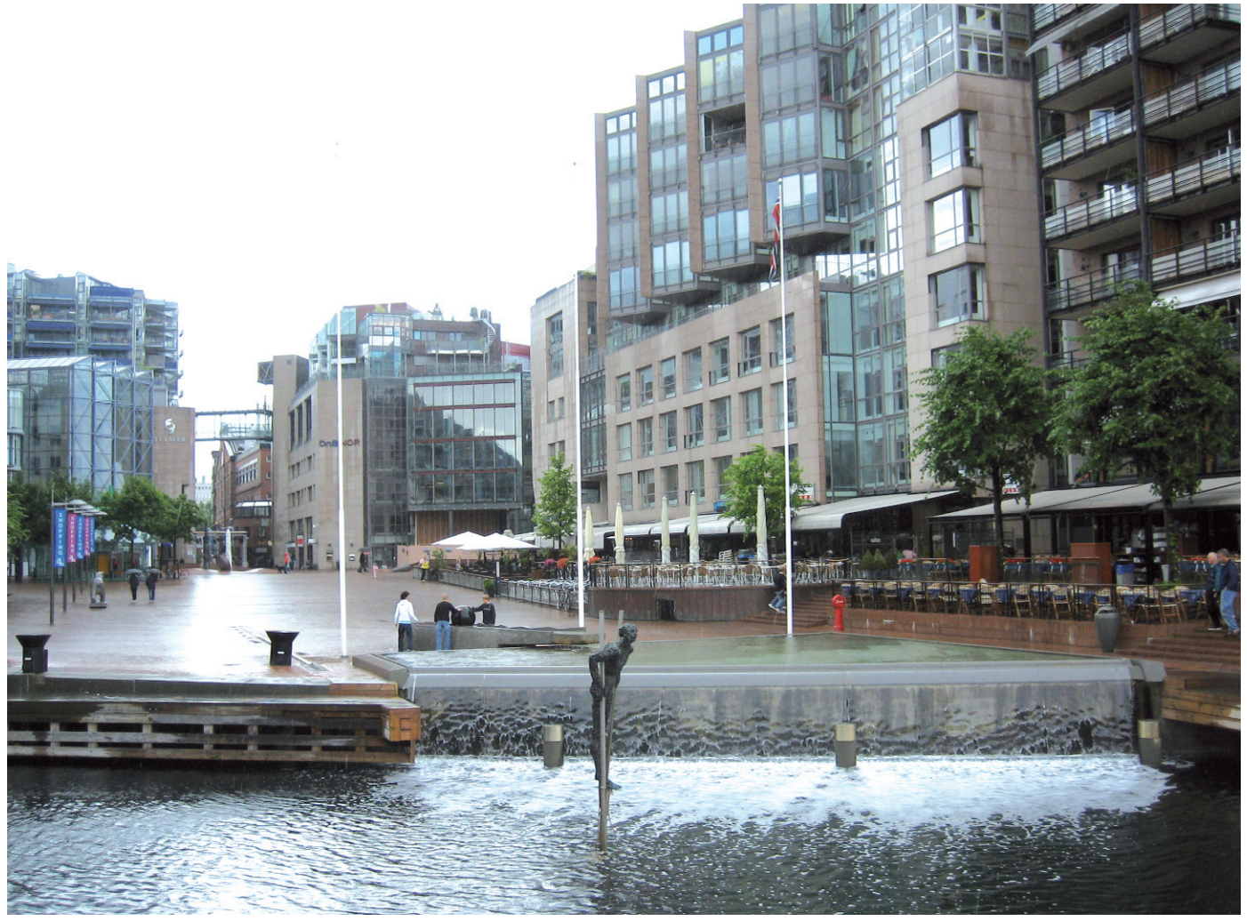
Figure 2: A Regenerated Area of Oslo, Norway